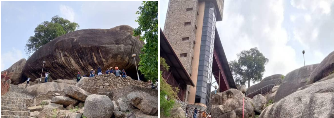
Figure 2: Selected Facilities at Olumo Rock Complex

Infrastructure development is a critical component for effective tourism management, playing an important role in improving visitor experiences and ensuring the viability of tourist destinations (Mwesiumo et al., 2022). According to interviews with respondents, strategic infrastructure investments have been critical in developing the Olumo Rock Tourist Complex into Nigeria's number one tourist attraction. The researchers observed modern amenities, such as paved roads, stairways, and elevators (Figure 2). Ogunleye (2020) argues that these amenities have increased accessibility for tourists, especially those with reduced mobility. In addition, these enhancements have not only improved tourist safety and comfort, but have also expanded the site's capacity to handle more visitors (Ogunleye, 2020).