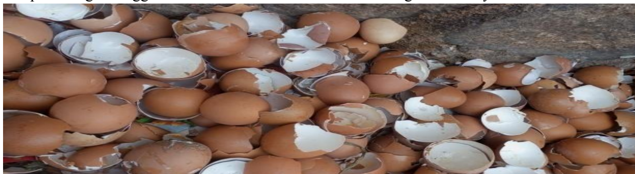
Plate I: Dried eggshell

The method employed in this study involves a systematic approach to investigating the use of eggshell powder (ESP) as a stabilizer for expansive soils. The eggshell sample used for this study was obtained from a tea shop and house-to-house kitchen waste collection in Jos, Plateau state, Nigeria. The eggshells were dried, ground into fine powder, and sieved through a 425 mm sieve. The percentage of Eggshell Powder on the volumetric shrinkage for 30 days Plate I.