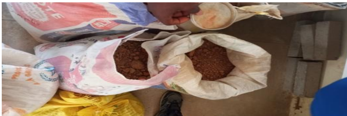
Plate II: Soil sample

The soil sample used for this study (undisturbed sample) was obtained from university of Jos permanent site, at Latitude 9.96557° or 9° 57' 56" North and longitude 8.88338° or 8° 53' 0" East, Jos, Plateau state Nigeria (Mapcarta, 2024). The topsoil was excavated to a depth of about 0.5m before obtaining soil samples in sacks and were sealed in plastic bags and put in sacks to avoid loss of moisture during transportation. The soil sample was then air-dried, pulverized and then sieved through several standard sieves for different types of tests with the largest sieve been BS No. 4 sieve (4.76 mm aperture) as seen on Plate II.